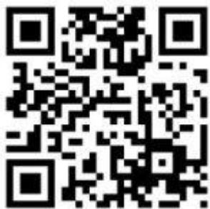
QR code for Naace website - try it out!

Another fascinating example is QR codes. QR code (abbreviated from Quick Response Code) is the trademark for a two-dimensional bar code. Recently, the QR Code system has become popular due to its fast readability and greater storage capacity. The code consists of black modules (square dots) arranged in a square grid on a white background. Look at ' 50 Interesting Ways to Use QR Codes ' on Googledocs. The work is licensed under a Creative Commons Attribution Non commercial Share Alike 3.0 License. Teachers around the world have added their ideas, tips and email addresses. It couldn't be easier to use. Examples include: use QR codes to vote using twittertools; QR Codes to enhance/extend information in books & printed material; Put a QR code in your classroom window so people can see inside; you can even colour code QRs to link to different subjects; make displays interactive; bring the web into the non-ICT classroom; link directly into Google Maps; create a kinaesthetic reading adventure; geocached QR Codes for revision/tests and Create a Virtual Museum - Past and Present. Half an hour with this resource will keep you busy for a month.