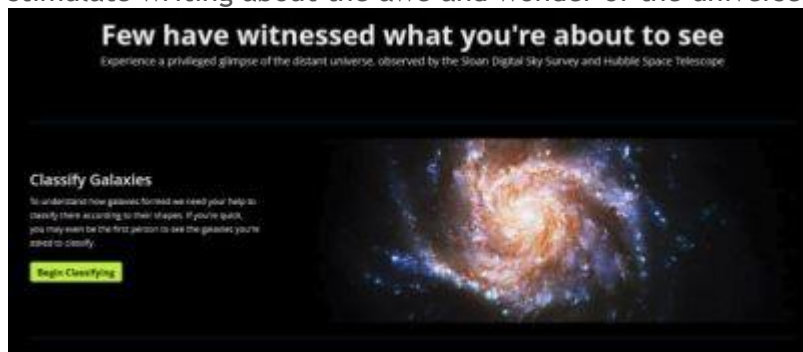
Part of Galaxy Zoo homepage.

Galaxy Zoo is a site that asks the public to help with the classification of galaxies. Hubble uses gorgeous imagery of hundreds of thousands of galaxies drawn from NASA's Hubble Space Telescope archive. Your students may even be the first person in history to see each of the galaxies they are asked to classify. This is a wonderful opportunity to be a 'real scientist'. Some schools are using these pictures to stimulate writing about the awe and wonder of the universe.